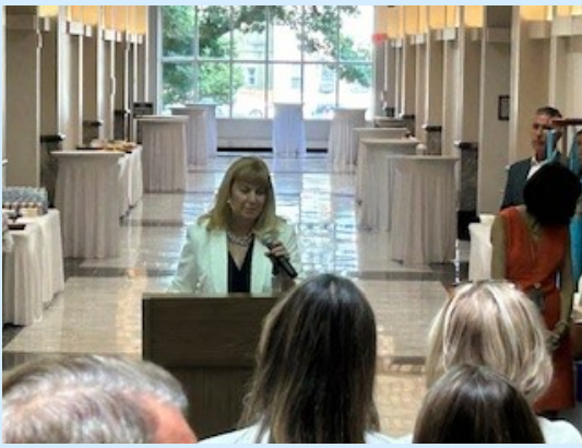
Chief Judge Renee Bumb (D.N.J.)