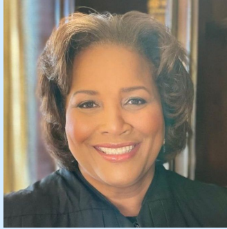
Hon. J. Michelle Childs U.S. Court of Appeals District of Columbia